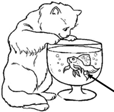
Figure 2. Stimuli used to induce processing style in Experiment 3. Note that the arrow in panel C is to aid the reader and was not shown to participants.

There was no difference between the control and local conditions ( p = .68 ).