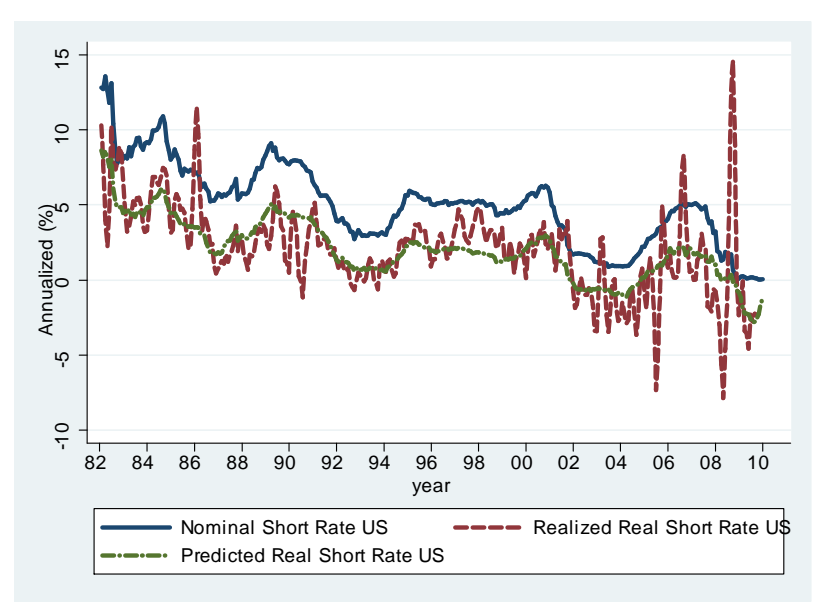
Figure 1: US Realized and Predicted Real Short Rate