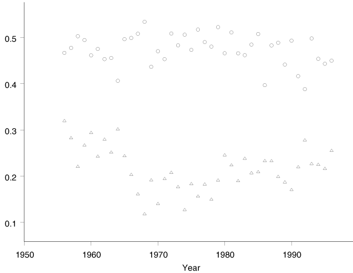
Fig. 1. Probabilities of winning of home (O) and away ( \Delta ) games when the teams are of equal strength